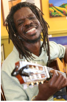
SAGA host Boundless Gratitude

Free! Open Mic, Poetry Reading, Storytelling, SAGA Music Circle, Beading Beauties, Body Painting Jam, Plein Air Sketch Group, Art of Perspective, Dramatic Readings and others.